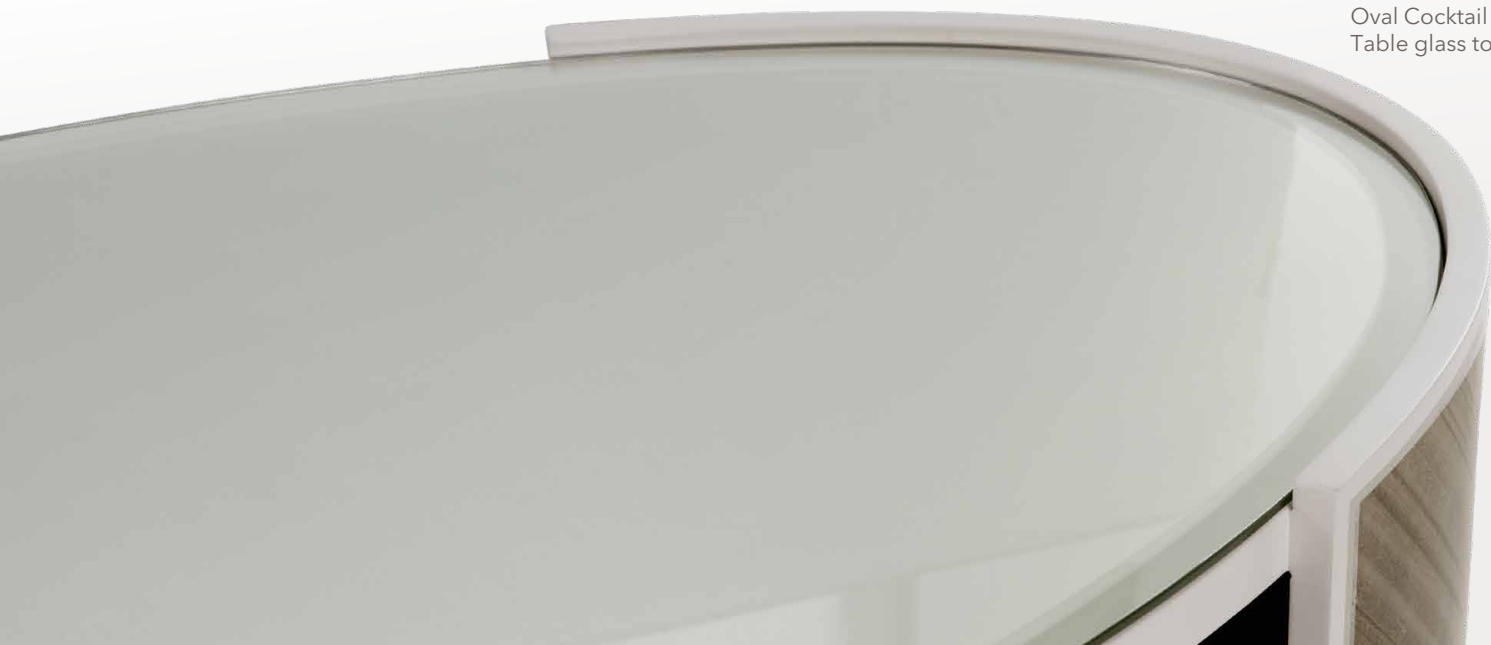
Oval Cocktail Table glass top