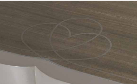
Oval Dining Table top design