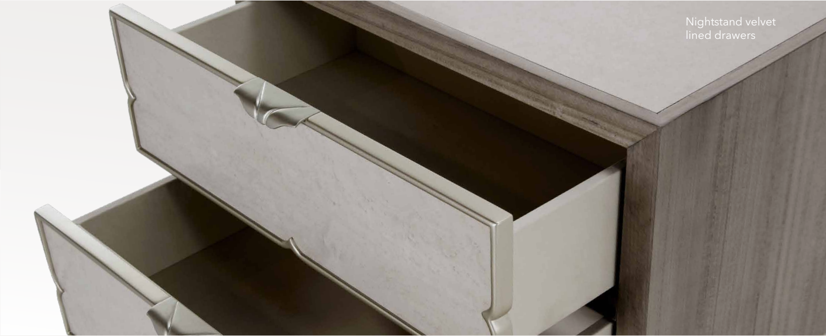
Nightstand velvet lined drawers

"Discover the new face of modern glamour with the Camden Court Quad Panel Bed! This bedroom centerpiece will transform your space with its subtle, pearly glow and sophisticated design. From the fabric's silky shine to the Platinum trim, USB ports, and acrylic feet, this bed is certain to bring the chic and modern brilliance you're looking for.