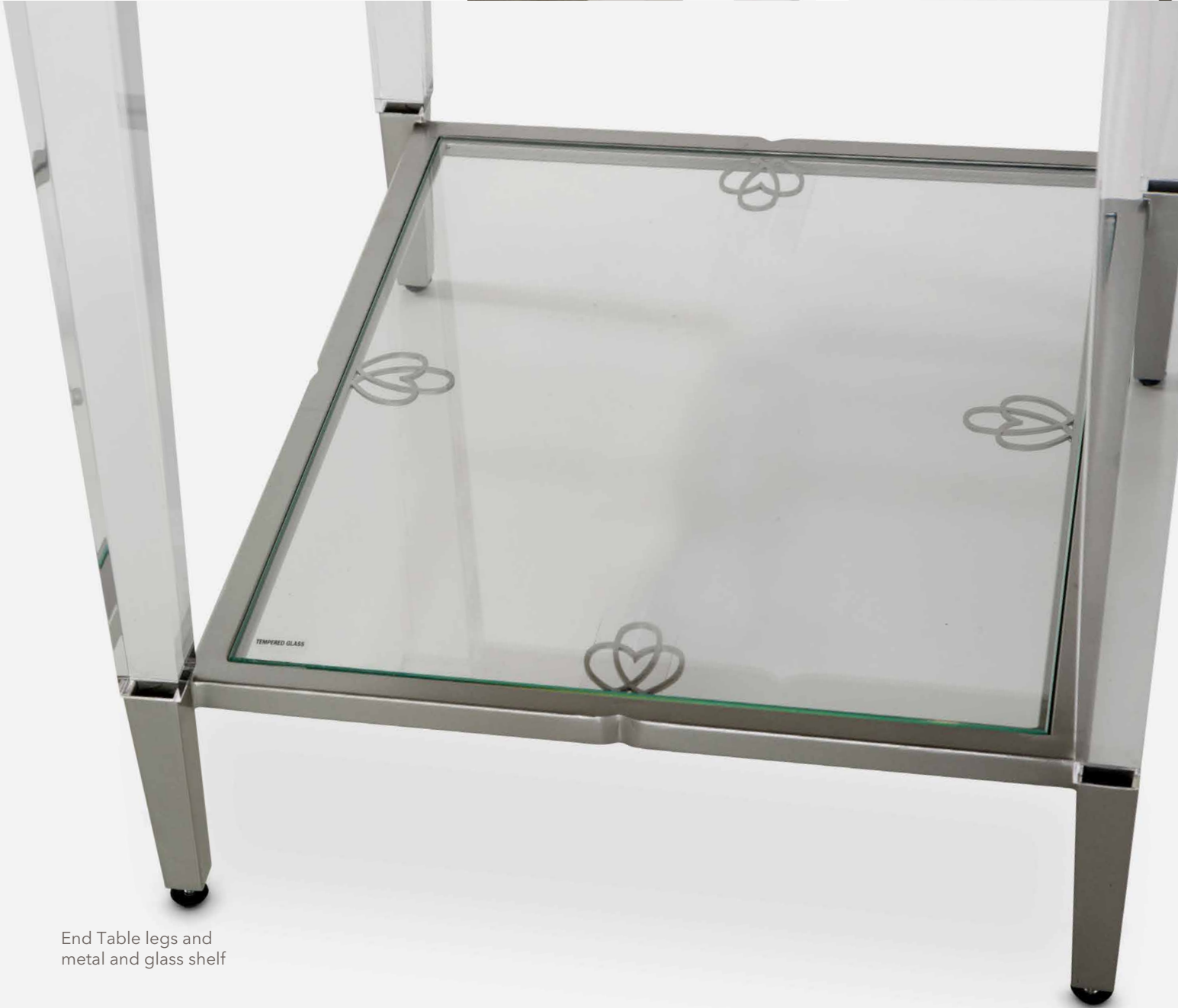
End Table legs and metal and glass shelf