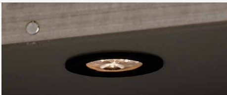
Sideboard silverware tray